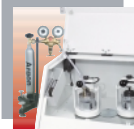
grinding in an inert atmosphere with the "pulverisette 4"