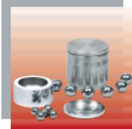
grinding bowls and balls